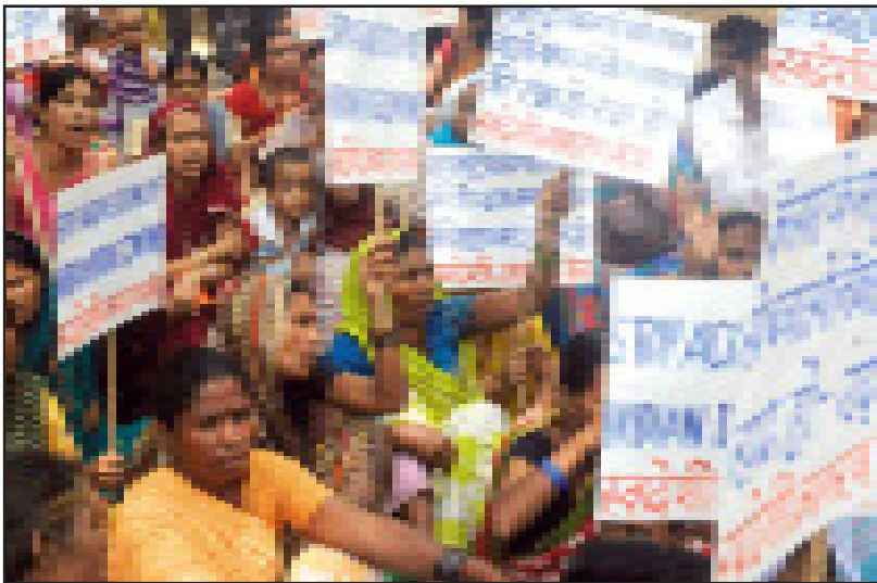
In this photograph taken on July 10, 2012, Swadeshi Jagran Manch activists demonstrate against Novartis in New Delhi. Activists say the company's patent challenge threatens access to cheap generic versions of life-saving drugs in poor nations.

Background of the case is, that a provision of Exclusive Marketing Rights was included by an amendment in Indian Patent Act 1970, according to which if a patent application was filed in the 'mail box', before the final amendment in patent laws are made, in pursuance of agreement with regard to TRIPS in General Agreement on Trade and Tariff (GATT); EMR would be granted to the applicant filing patent application. According to the EMR, the applicant would get an exclusive right to manufacture and market the product under question. Accordingly, an EMR was granted to Novartis for its medicine Gleevec, with brand name imatinib. On the basis of this EMR, the company filed an application to disallow other companies to manufacture and market that medicine, and Madras High Court decided in favour of the company and